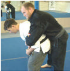
Stick your rear end out