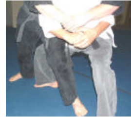
step around behind them