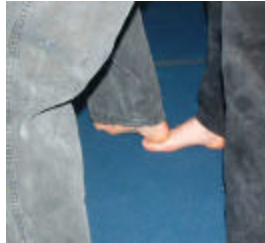
Stomp their foot